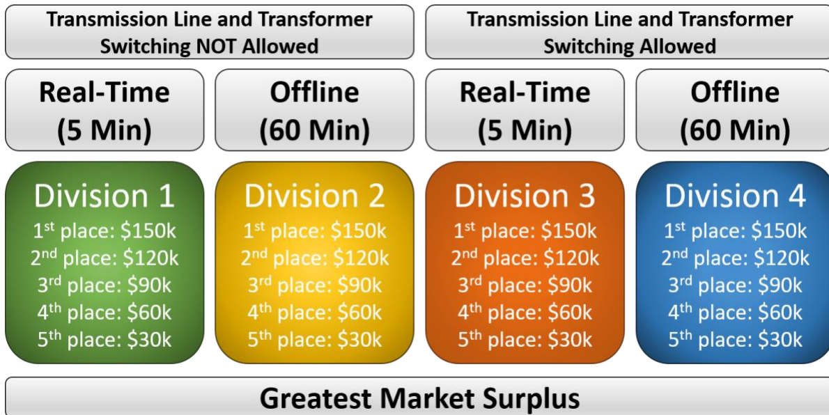
Figure 2. Breakdown of the Divisions and Prize/Grant Money for Eligible Entrants in the Final Event.

Figure 3 shows a visual representation of two notional algorithms, with Algorithm 1 winning Division 1, and Algorithm 2 winning Division 2. Entrants will be able to submit their executable program (source code) with the ability to adjust their algorithmic approach based on division; there will be an input parameter that will reflect the selected division.